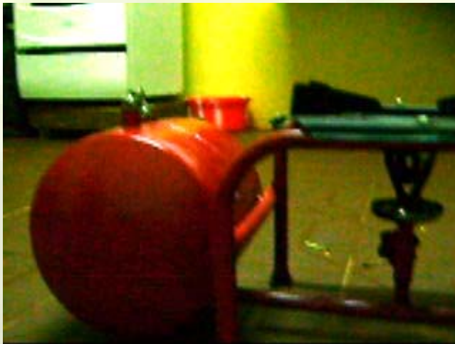
(Fig 3) Work target for interactive user friendly design: The Tank and burner!