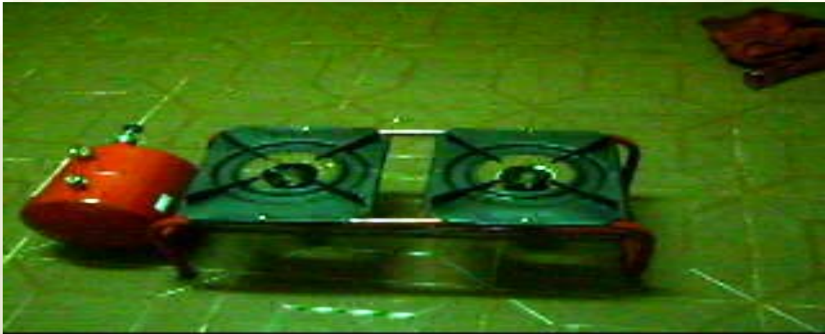
(fig 1) Full picture of the wheel double kerosene stove.